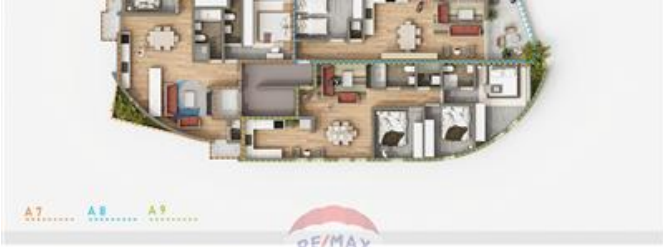
3 THIRD FLOOR PLAN - PROPOSED SCALE 1:200