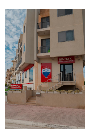
RE/MAX Professionals - Mosta RE/MAX Professionals - Mosta