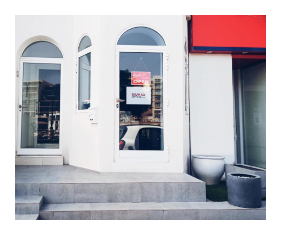
RE/MAX First - St. Julian's RE/MAX First - St. Julian's