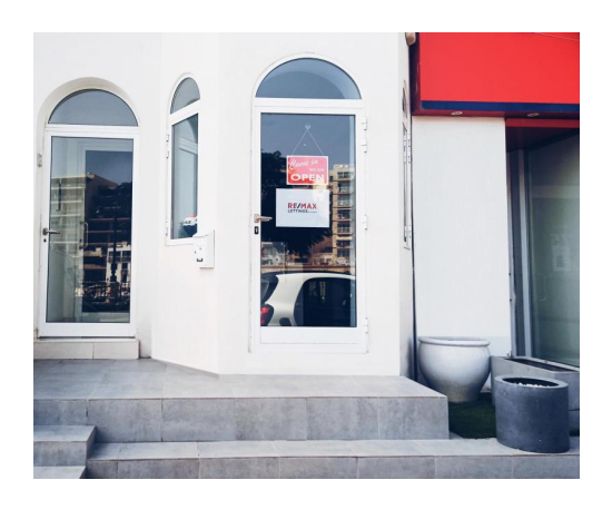
RE/MAX First - St. Julian's RE/MAX First - St. Julian's