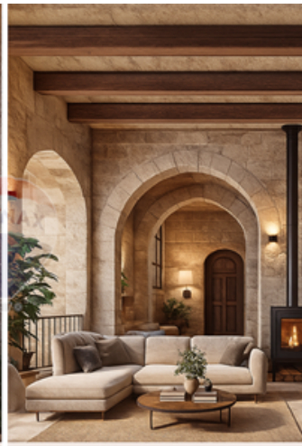
BOUTIQUE HOTEL LOBBY