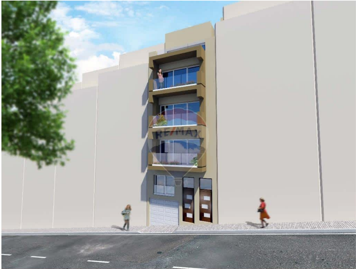
Description: Artistic view