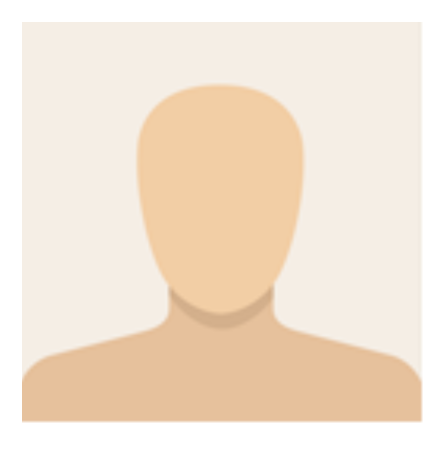
RE/MAX Superior - Fgura RE/MAX Superior - Fgura