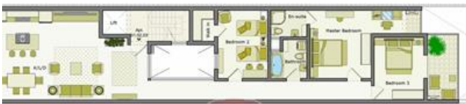
LEVELS 1, 2, 3 - 3 Bedrooms apartments GROSS INTERNAL AREA - 153.89m 2 GROSS EXTERNAL AREA - 18m 2