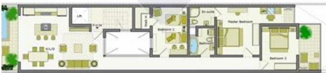
PENTHOUSE - 3 Bedrooms apartment with Jacuzzi terrace, large roof top pool, sun lounge and BBQ area GROSS INTERNAL AREA - 134.76m 2 GROSS EXTERNAL AREA - 32.70m 2