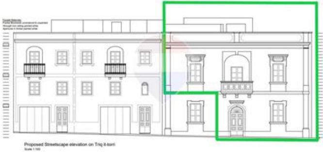
Proposed Streetscape elevation on Triq 8 Jan Scale 1:100