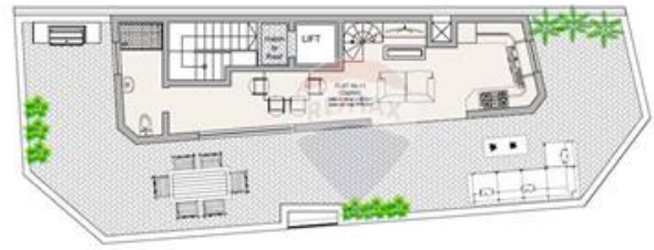
RECEDED FLOOR AS PROPOSED Scale 1:100