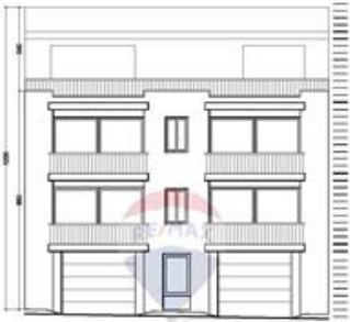
Front Elevation (1/20) Ground Floor Area: 1000 sq. ft. With aluminum windows and siding