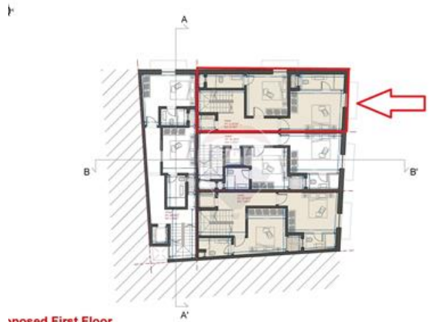
Proposed First Floor