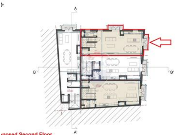
Proposed Second Floor