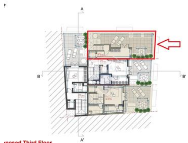
Proposed Third Floor