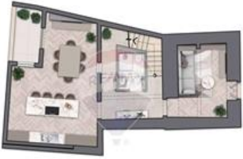
Proposed Ground Floor level Scale 1:100