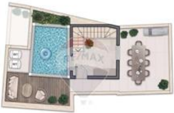
Proposed Roof Floor level Scale 1:100