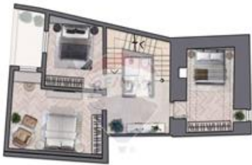
Proposed First Floor level Scale 1:100