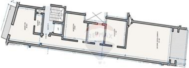
HIRD FLOOR KOPÖZÖD