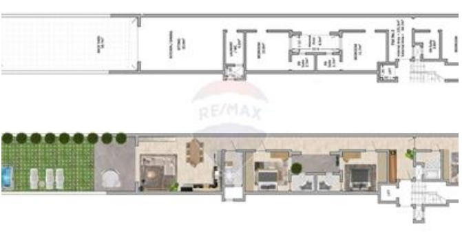
CAL 3 BEDROOM SONETTE