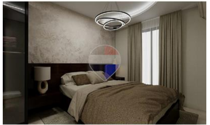
Master Bedroom & En-Suite