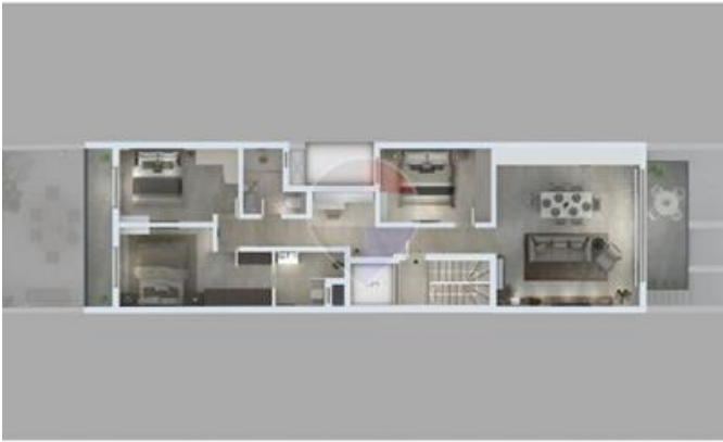
Typical Apartment - Artistic Plan View