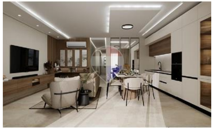
Open Plan & Corridor