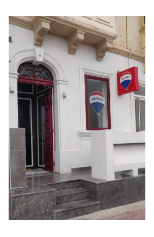
RE/MAX Premium - St.Julian's RE/MAX Premium - St Julian's